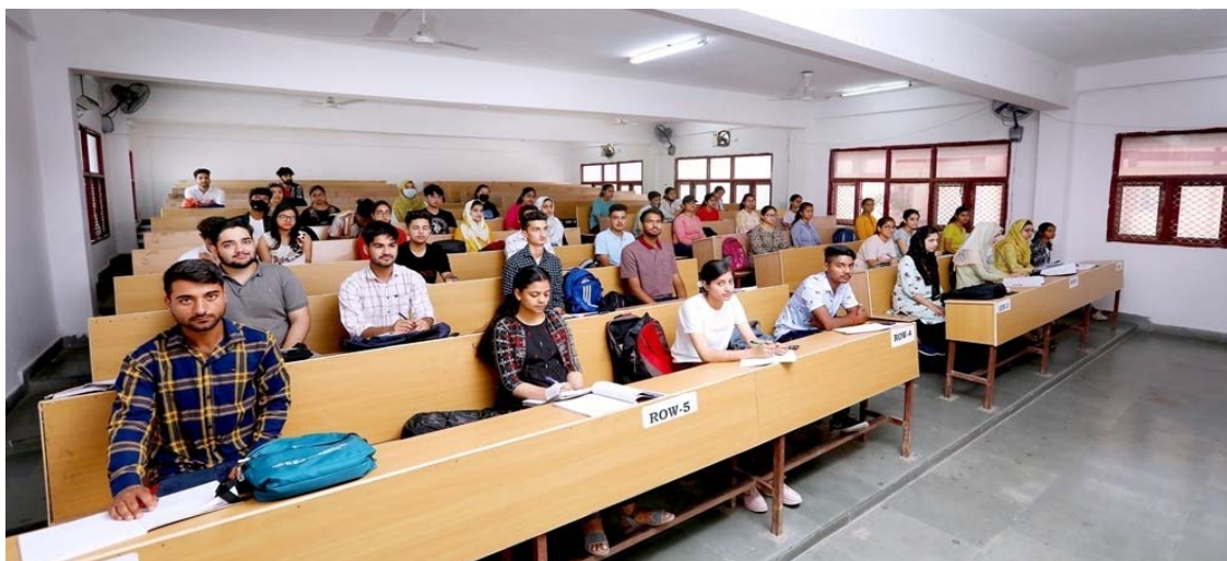
University Examination Cell

The examination cell of the University was established in November 2012, to conduct and regulate the examinations smoothly, as well as to set up a confidential communication channel with external examiners.