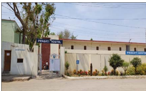
Pragati Hostel (Girls)