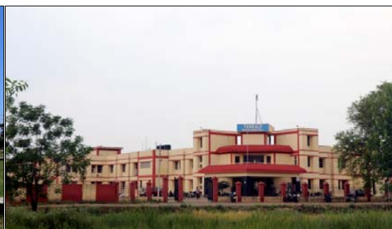
Sankalp Hostel (Boys)