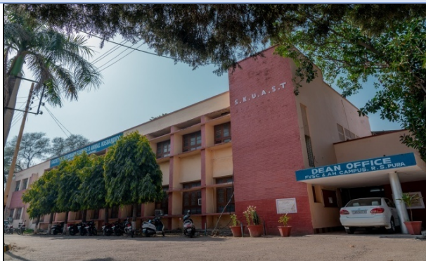
Faculty of Veterinary Sciences & Animal Husbandry