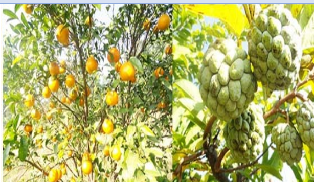
Faculty of Horticulture & Forestry