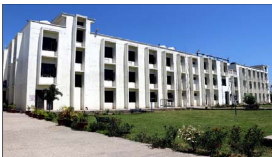
Urja Hostel (Girls)