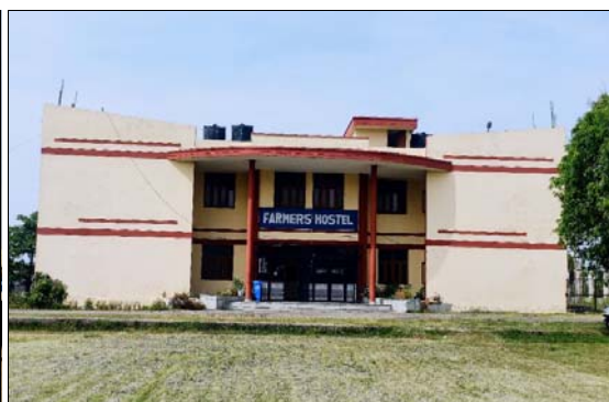
New Hostel (Girls)