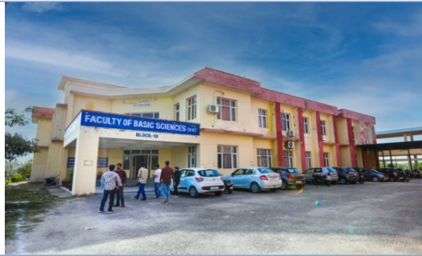
Faculty of Basic Science

The University has highly structured infrastructure facilities in terms of buildings, laboratories, lecture rooms, instructional and research farms, modern instruments/ equipments, farm machinery, transport and library facilities. It has distinguished and qualified faculty positioned at all the campuses and regional research stations. The faculty members and the post-graduate students of the University have won numerous national and international recognitions in the forms of awards, honours and fellowships awarded by the prestigious professional scientific bodies/societies.