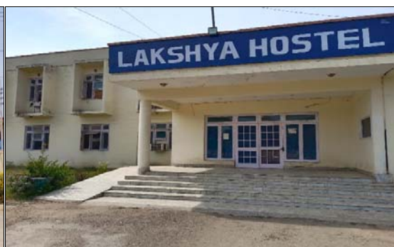
Lakshya Hostel (Boys)