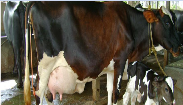
Faculty of Dairy Technology