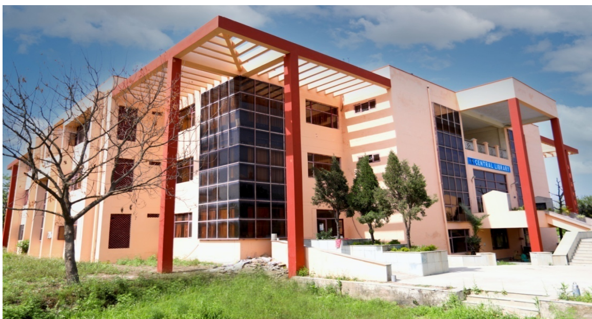
Central Library, Chatha

Sher-e-Kashmir the University of Agricultural Sciences and Technology of Jammu (SKUAST-Jammu) comprises of Central Library at Faculty of Agriculture (FOA), Main Campus, Chatha and Faculty Library at R.S. Pura. Both the libraries have open access and are housed in their respective modern and spacious buildings. The Central Library is a modern three storey glazed building having 5382 sq. meter area built up at the cost of Rs. 945 lacs. The Faculty Library at R.S. Pura, has an area of 2937 sq. meter area. In both the libraries the collection comprises of documents in the field of Agricultural, Veterinary and allied sciences. Online Library system consisting of network terminals for providing access to e-journals, e-books, internet and other e-reference resources are provided to the scientists, scholars, students and staff. Library functions and requirements have been kept in view while planning and equipping it. Both the libraries contribute and support the University in building an internationally top ranked academic and research driven institution by establishing a knowledge hub. Library services are witnessing radical changes world over and accessibility and instant retrieval of information is the main focus.