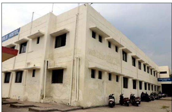
Ujala Hostel (Girls)