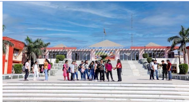
Faculty of Agriculture

The University has extensive infrastructure within its jurisdiction and command. The main campus at Chatha is spread over 578 acres, where Faculty of Agriculture, Faculty of Basic Sciences, Faculty of Agricultural Engineering, Faculty of Horticulture & Forestry and Institute of Biotechnology are located. Faculty of Veterinary Sciences & Animal Husbandry and Faculty of Dairy Technology at R.S. Pura have an extent of 84 acre campuses. The total land possession with the University (including Research Stations/ Sub-Stations and KVKs) is 1139.12 acres. There are 09