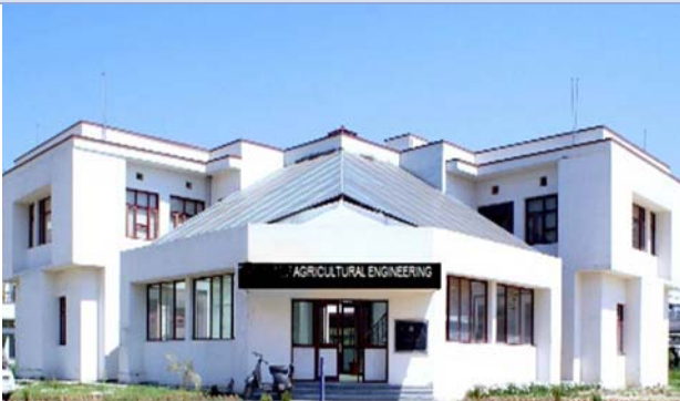
Faculty of Agricultural Engineering